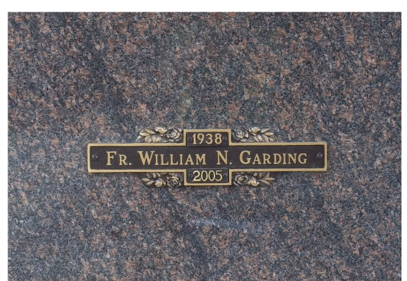
Added by: Choc-a-hol-ic