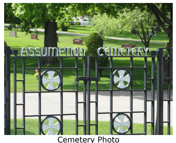
Added by: Quincy Stroeing