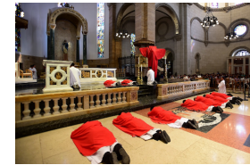
Cruelty towards flock haunts clergy amid sex abuse crisis