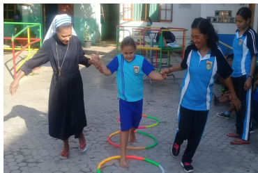
Timor-Leste nuns seek to take difficulties out of learning