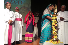
A decade on, anti-Christian riots inspire Indian Church

Sign up to receive UCAN Daily Full Bulletin