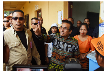
Policeman accused of killing three at Timor-Leste party