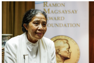
Timorese woman defies odds, church leaders to help poor